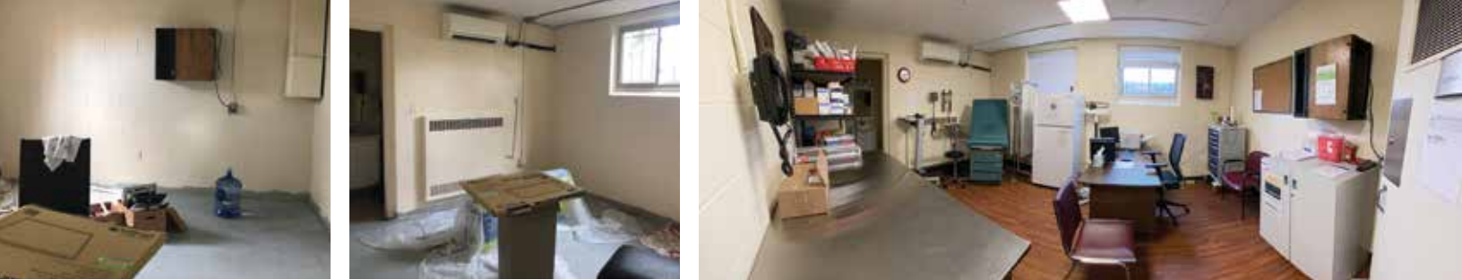
Before and after photos of the newly renovated health care clinic at Joseph's Home.