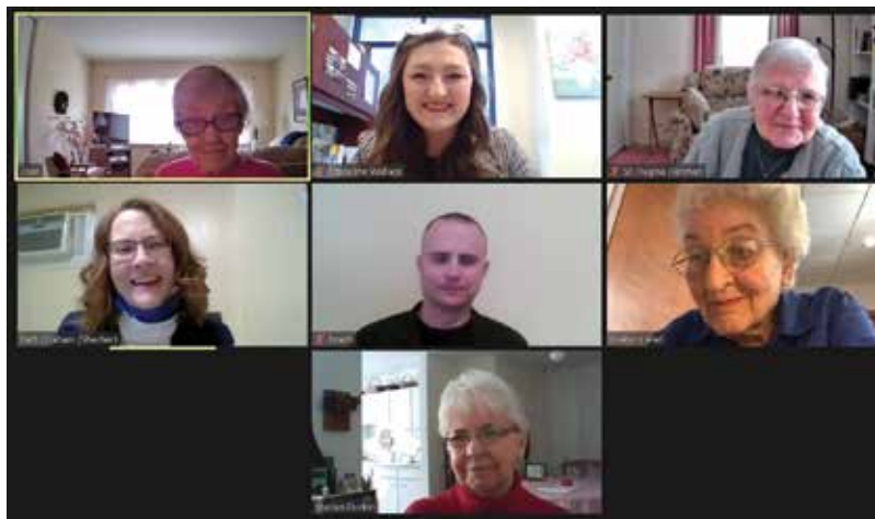
Members of the Dream Team joined Joseph's Home staff for a virtual discussion about the establishment of Joseph's Home and their hopes for the future of the ministry.